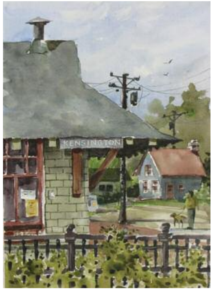
Kensington Train Station

One of the challenging and fun features of the Labor Day show is a Plein Air Event that takes place on Saturday, September 4th from daybreak to 3:00 pm. This event is free for members of MAA and $5.00 for non-members. You do not need