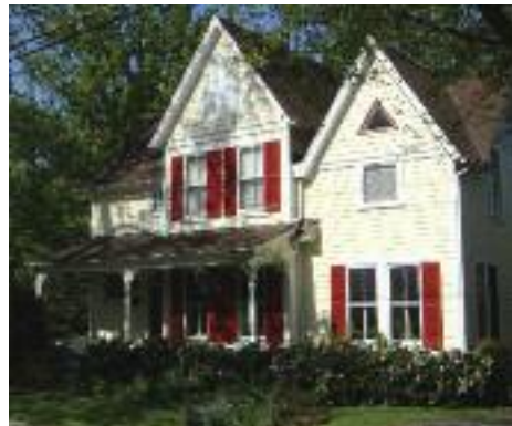
Kensington Painting Subject