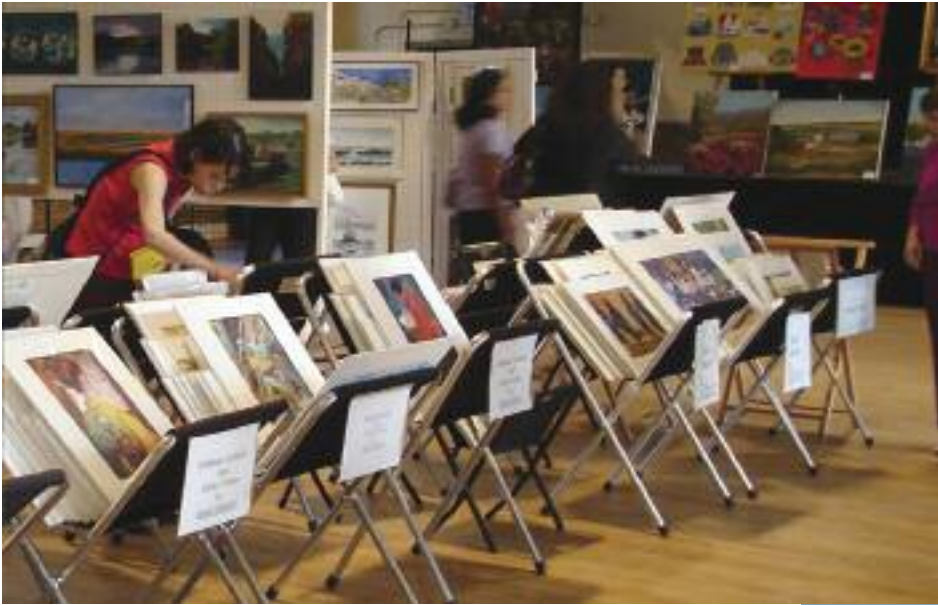
2009 Labor Day Show