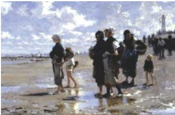
Setting Out to Fish John Singer Sargent

We can look to his experiences on two Trans-Atlantic voyages—ten days apiece in 1876 for the early indications of his style. Sargent was clearly impressed, if not profoundly awed, by the vastness and power of the ocean. Its rhythms, its changeability, and its energy become his focus in a number of studies painted on and immediately after his first journeys. A rather clumsy painting of the wake of the ship he travels on nevertheless shows the artist's interest in capturing the awesome power of the water, its energy, and its fury. To achieve an accurate portrayal of water (as those of you who've tried it will know), one must let go of strict mimesis and rather attempt to 'understand' the patterns and rhythms of the colors the water contains. Its ever-changing, yet repetitious, form can only be truly captured through a loose